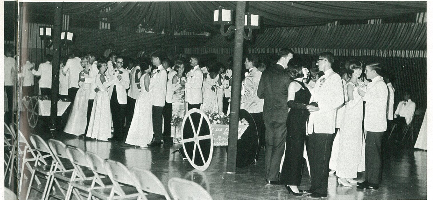
Few chairs are left filled during the dance.