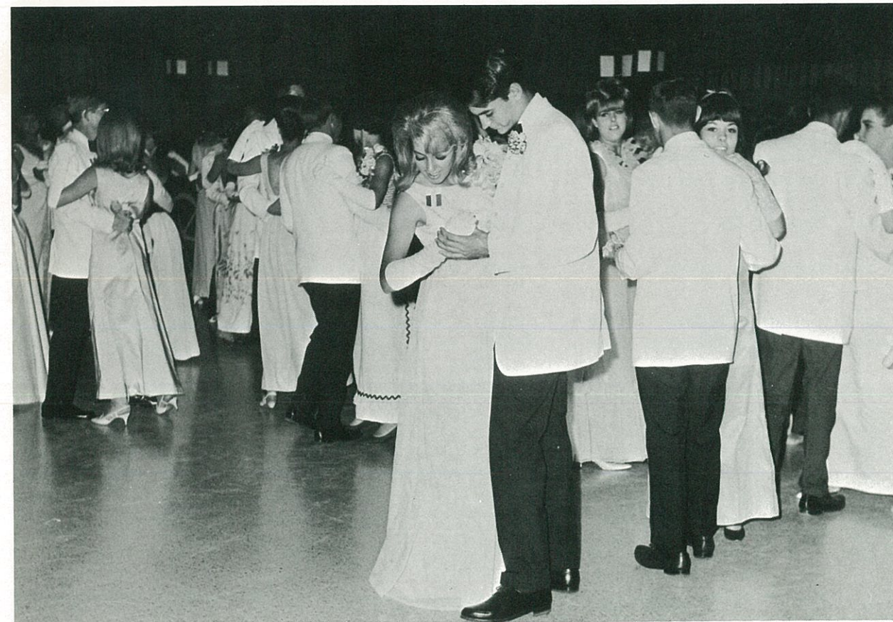
Students dance to the music of Bob and the Agents.